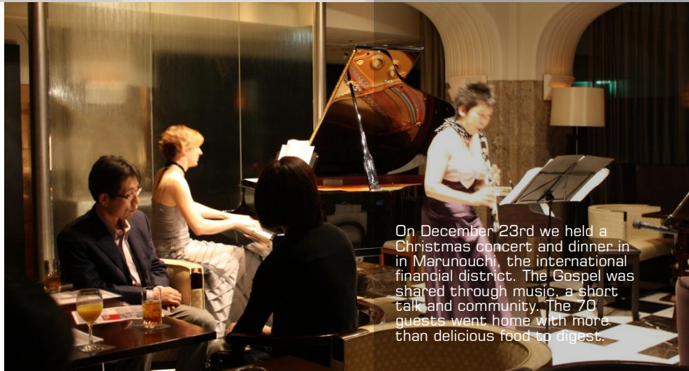
On December 23 rd we held a Christmas concert and dinner in Marunouchi, the international financial district. The Gospel was shared through music, a short talk and community. The 70 guests went home with more than delicious food to digest.