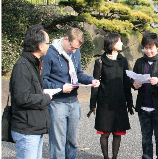
Early December the launch team had its first prayer walk in the area around Tokyo station.