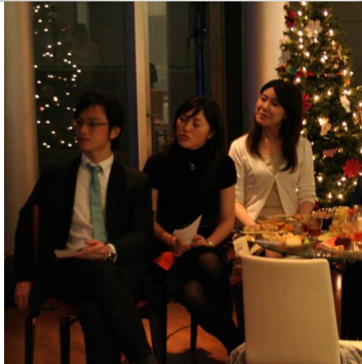
Christmas Eve 08 Party was the first event Grace City Church Tokyo organized as part of our strategy to build relationships with our non-Christian fellow urbanites. We believe such events serve to build the launch team and strengthen our city-focused 'DNA'.