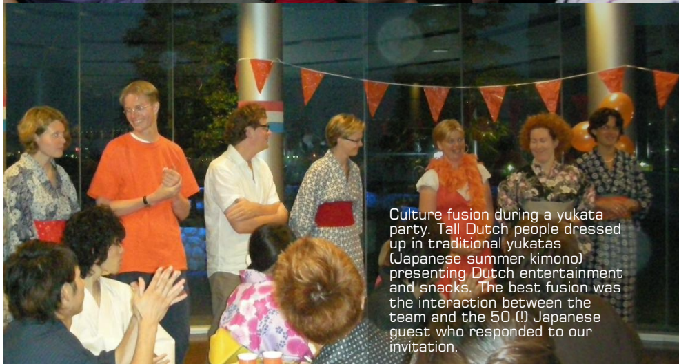
Culture fusion during a yukata party. Tall Dutch people dressed up in traditional yukatas (Japanese summer kimono) presenting Dutch entertainment and snacks. The best fusion was the interaction between the team and the 50 (!) Japanese guest who responded to our invitation.